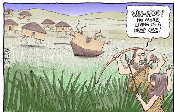
Early house hunting